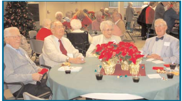
Residents enjoy themselves at the recent Ashlar Village Holiday Party hosted by The Foundation

The Masonic Charity Foundation always enjoys holding special functions at Ashlar Village. We have had several entertaining programs over the past year, with wonderful attendance by the residents. These educational and social events culminated this December in our second annual Ashlar Village Holiday party. The gathering consisted of delicious holiday treats and beverages as well as entertainment by a few special guests from the Coginchaug High School choir who led residents in some festive caroling. This month's program was the best attended so far, with 103 residents and each household took home a potted poinsettia plant as a special holiday gift.